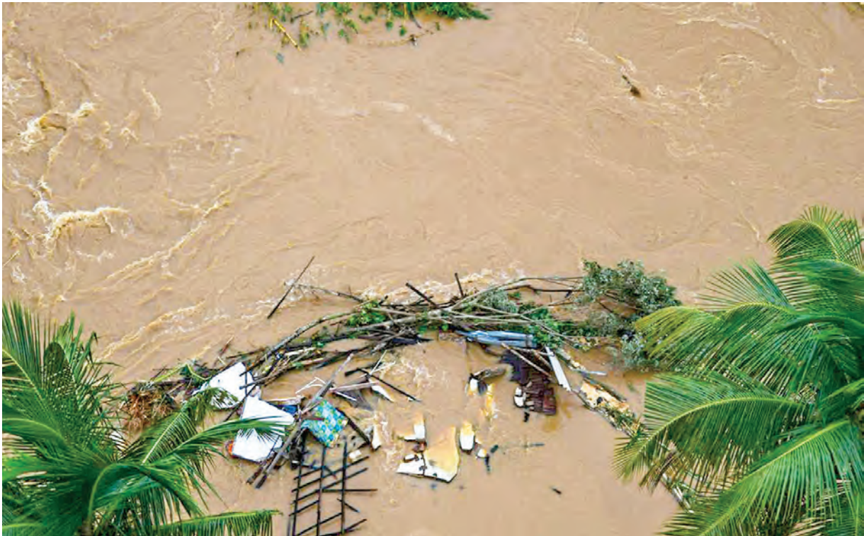
Aa damaged structure at a cyclone-hit area. National Disaster Response Force (NDRF) personnel in coordination with local authorities undertake relief operations as part of Operation Sagar Bandhu in Sri Lanka.