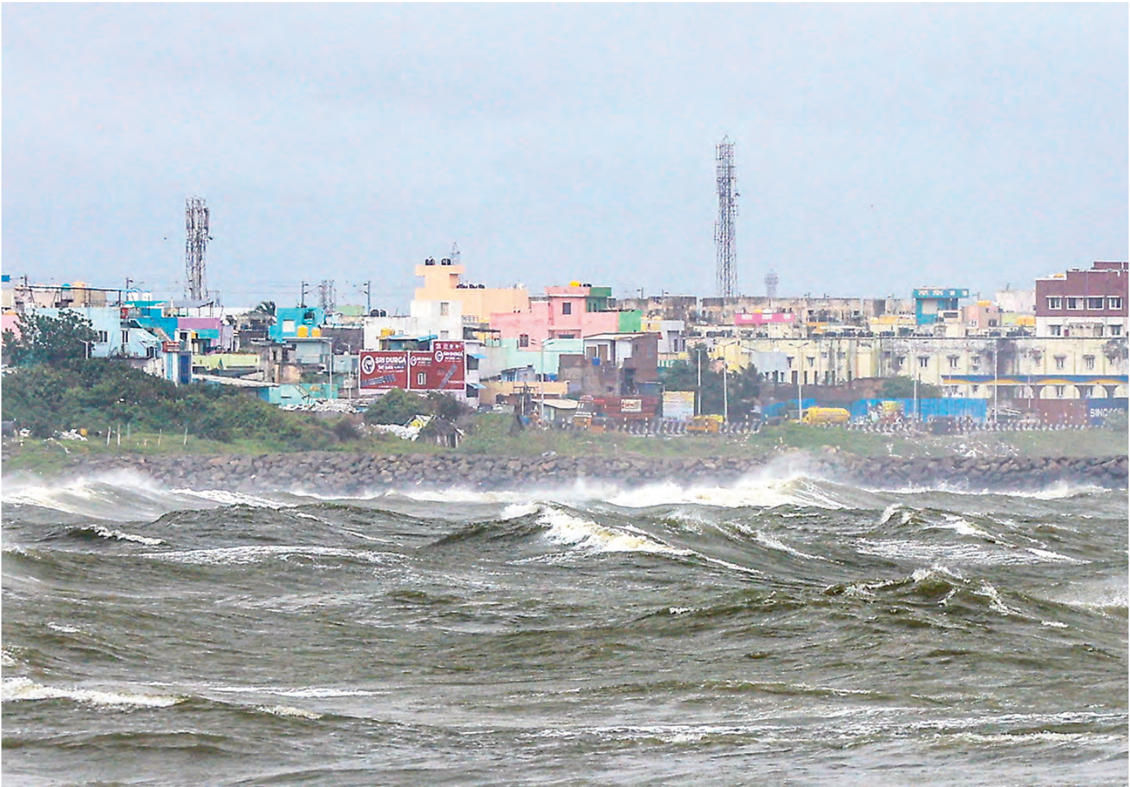
High waves lash the Kasimedu shoreline amid rough sea conditions in the wake of the Cyclone Ditwah, in Chennai, on Sunday.

“Three people have lost their lives in rain-related incidents since last evening. While two persons died due to wall collapse in Tuticorin and Thanjavur, respectively, a 20-year-old youth died due to electrocution in Mayiladuthurai,” he said while briefing reporters at the State Emergency Operations Centre on Sunday.