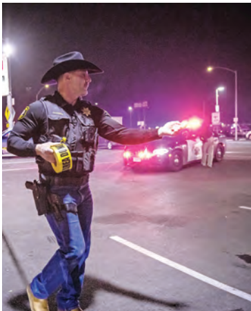
First responders close off a parking lot near the scene of a mass shooting in Stockton, Calif.

The shooting occurred just before 6 pm inside the banquet hall, which shares a parking lot with other businesses. Stockton is a city of 320,000