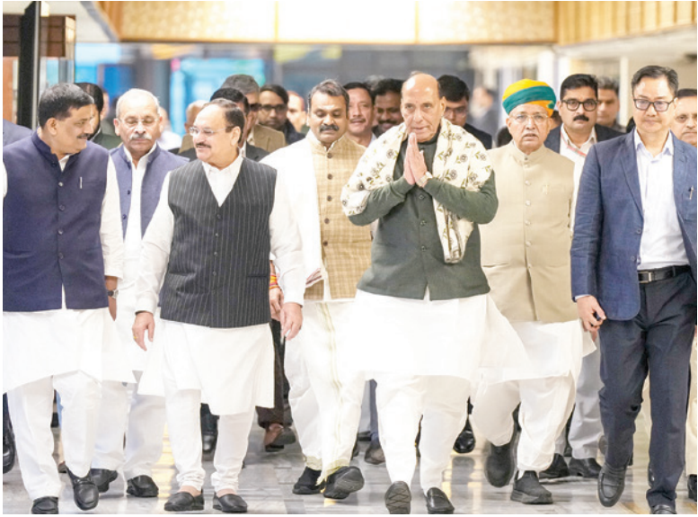
Union Ministers Rajnath Singh, JP Nadda, Kiren Rijiju, Arjun Ram Meghwal, JD(U) MP Sanjay Jha and others during the all-party meeting ahead of Parliament's winter session. tinue to engage with all parties and appealed for calm deliberation. Defence Minister Rajnath Singh, BJP president J P Nadda and Parliamentary Affairs Minister Kiren Rijiju were among those present, alongside 50 leaders from 36 parties. Rijiju urged restraint, saying Parliament must not be stalled and that cooperation would strengthen democracy.

The Winter Session of Parliament opens on Monday under mounting political tension, with the Special Intensive Revision, SIR, of electoral rolls emerging as the dominant flash-point. Several Opposition parties have warned that they may disrupt proceedings in both Houses if a debate on SIR is not permitted, setting the stage for a contentious 15 day session that could be the shortest in parliamentary history. At Sunday's all party meeting, convened by the government to seek cooperation for smooth functioning, Opposition leaders pushed strongly for a structured discussion on SIR as well as national security concerns following the Delhi blast. Air pollution in the capital, unemployment, price rise, foreign policy, labour codes and charges of governors withholding bills passed by state legislatures were also raised. The government said it would con-