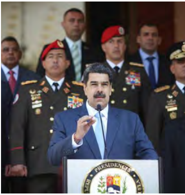
WEST PALM BEACH (US), NOV 30

PRESIDENT Donald Trump on Saturday said that the airspace “above and surrounding” Venezuela should be considered as “closed in its entirety,” an assertion that raised more questions about the US pressure on Venezuelan leader Nicolás Maduro. His government accused Trump of making a “colonial threat” and seeking to undermine the South American country’s sovereignty. The White House did not respond to questions about what Trump posted on his Truth Social platform, and it was unclear whether he was announcing a new policy or simply reinforcing the messaging around his campaign against Maduro, which has involved multiple strikes in the Caribbean Sea and eastern Pacific Ocean on small boats accused of ferrying drugs as well as a buildup of naval forces in the region. More than 80 people have been killed in such strikes since early September. The Republican president addressed his call for an aerial blockade to “Airlines, Pilots, Drug Dealers, and Human Traffickers,” rather than to Maduro. Venezuela’s government said it “forcefully rejects” Trump’s claim about closing the airspace and that