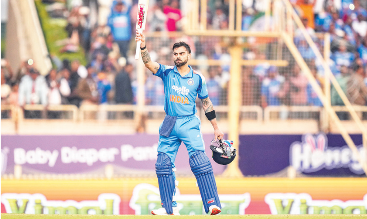
Virat Kohli celebrates his 52nd century during the first ODI cricket match of the series between India and South Africa, at JSCA International Stadium Complex, in Ranchi. India won the cliffhanger by 17 runs. (See also Page 11)