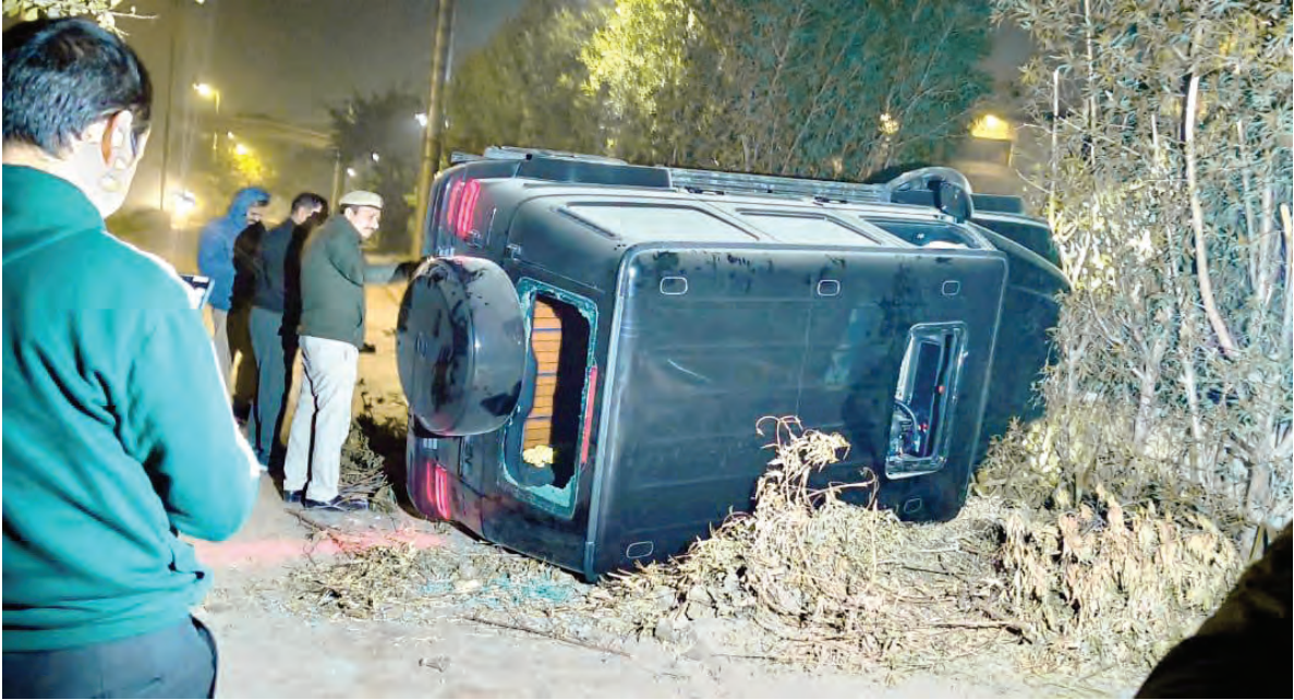
A Mercedes SUV (G63) turned over after it allegedly rammed into three near a mall in Vasant Kunj area, New Delhi. A 23-year-old man died and two others sustained injuries in the incident.