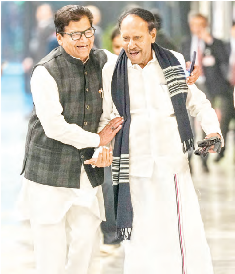
Samajwadi Party MP Ram Gopal Yadav and AIADMK MP M Thambidurai during the all-party meeting ahead of Parliament's winter session, in New Delhi.

government and the creator is bigger than the created, he said. “Why can’t discussion be done when wrongdoing is being committed. If the prime minister’s (Narendra Modi) name is cut then will a discussion not take place?” Yadav said. “I have gone to many places, and I am still travelling. I have been a voter since 1967. In the Etawah district, all of us have been put under Category C. Everyone in the entire district has been placed in Category C. From our district, there are seven MPs from both Houses of Parliament and three MLAs, and every single one of them has been placed in Category C,” Yadav said. The customary meeting was convened to ensure a smooth session which is slated to see introduction of several new bills. The Winter session commences on Monday and will conclude on December 19. There will be a total of 15 sittings in the session which has been dubbed as a “brief session” by the opposition. Usually, Parliament sessions have 20 sittings.