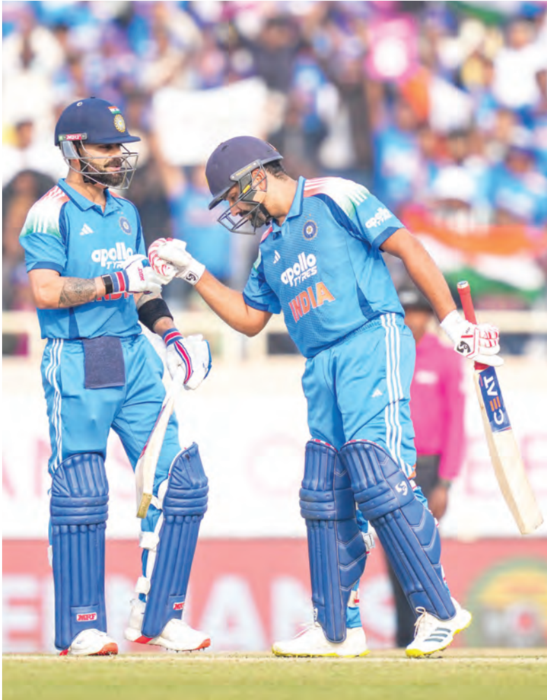
India’s Virat Kohli, left, celebrates his half century with Rohit Sharma during the first ODI cricket match of a series between India and South Africa, at JSCA International Stadium Complex, in Ranchi, Jharkhand.

INDIA secured a tense, high-scoring victory over South Africa in the first ODI at the Ranchi Cricket Stadium, holding their nerve in the closing overs after senior batter Virat Kohli produced an outstanding 135 to propel the hosts to a formidable 349 for eight. The match, which swung back and forth under lights, kept the packed crowd on its feet until the final moments of play. Kohli’s 52nd hundred in the 50-over format was a masterclass in temperament and shot selection. His 120-ball knock included eleven boundaries and seven sixes, and his 136-run partnership with Rohit Sharma shaped the innings during a crucial middle phase. Rohit played his part with a brisk 57 off 51 balls, helping India dominate an inexperienced South African attack during the early afternoon session. South Africa won the toss and opted to bowl first, expecting dew to aid their chase. That decision appeared to backfire as India crossed the 100-run mark inside 15 overs, with Kohli and Rohit taking charge after the early departure of Yashasvi Jaiswal. Ruturaj Gaikwad provided brief support before falling, and the Proteas tightened their lines in the middle overs, forcing a slowdown in the scoring rate. But Kohli remained composed and brought up his century with a punch through the off side to a