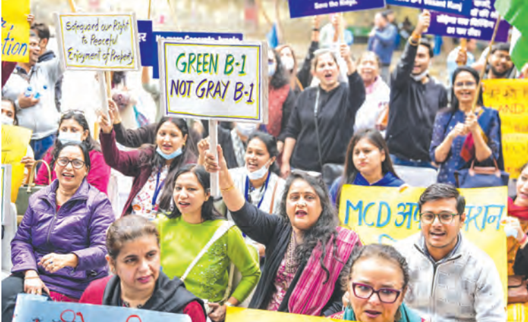
Residents of Sector B, Pocket 1, Vasant Kunj, raise slogans during a protest against the proposed construction of multi-storey buildings in the area, at Jantar Mantar, in New Delhi.